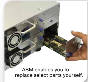
ASM enables you to replace select parts yourself.