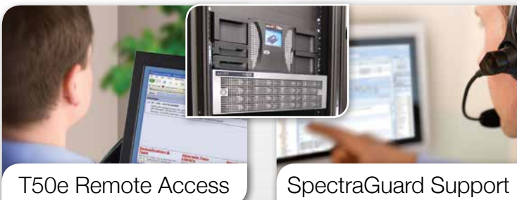
T50e Remote Access