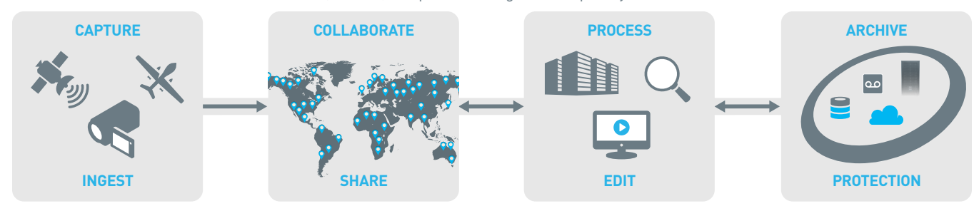
Fig. 2: Large, data-intensive workloads served by Quantum's StorNext Scale-out Storage.

StorNext enables high-performance capture, collaboration, archive, and protection of valuable data. Reliable, secure, and proven storage from experts you can trust.